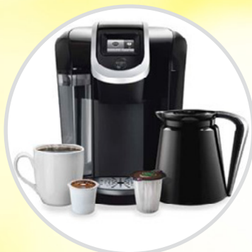
Keurig Brewing System Value: $149.99