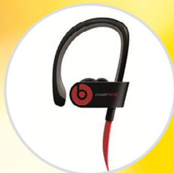
Beats Headphones Value: $199.00