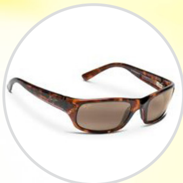
Maui Jim® Sunglasses Value: $229.00