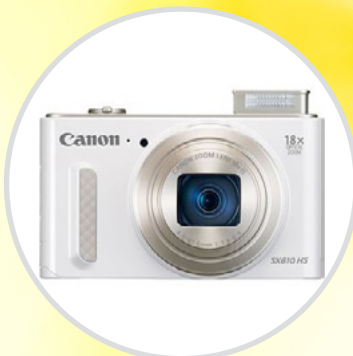
Canon PowerShot Value: $349.99