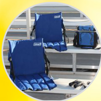
Coleman Bundle Value: $198.99